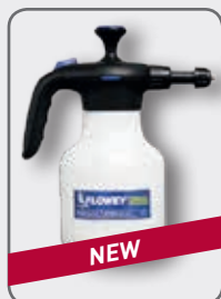
61016 Jet foamer 1500ml