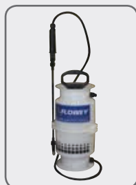
50054 NEW Sprayer 5l